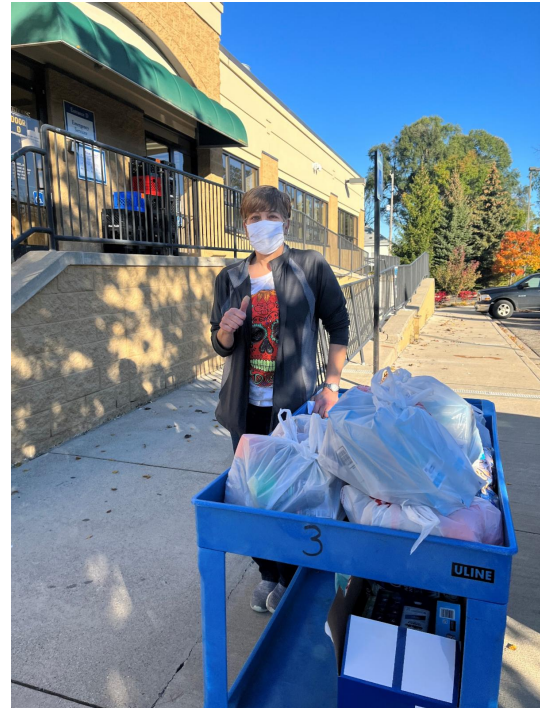
Lighthouse volunteer accepts OCMS personal hygiene donations